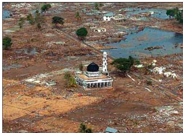
Fig. 5: Banda Aceh Mosque, still standing after 2004 Tsunami

Apropos to the discussion of waves, tsunamis and rapidly moving flood waters, Hurricane Katrina in 2005 and Hurricane Sandy in 2012 are the two most recent events in the United States that come most to mind. The 1993 Midwest Floods in the United States covered a vast area, but in many ways the coastal Hurricane Katrina was far more devastating