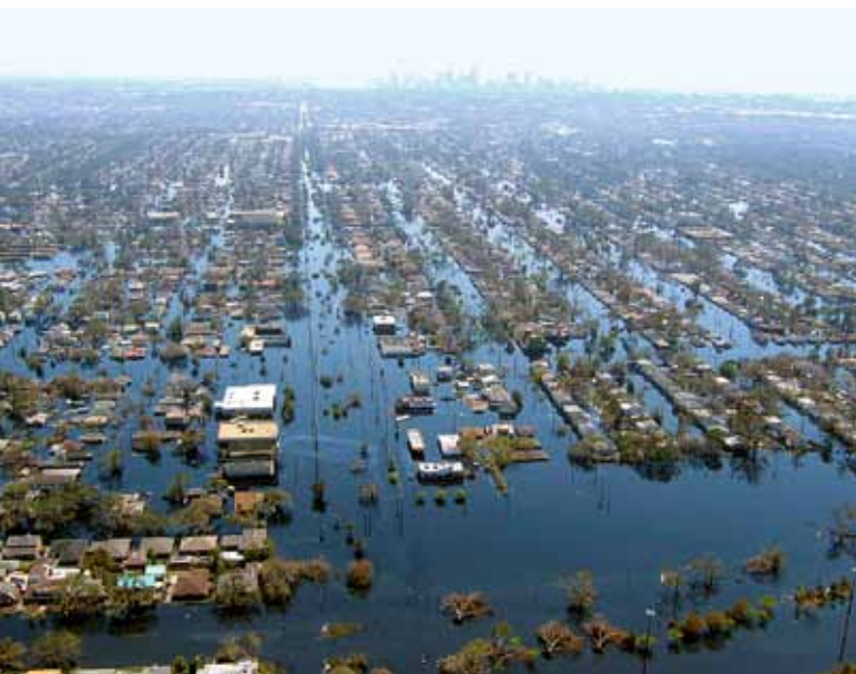
Fig. 6: New Orleans, extent of flooding after failures of the levees over the course of several days following the hurricane. The high-rise buildings in the city center can be seen way in the distance