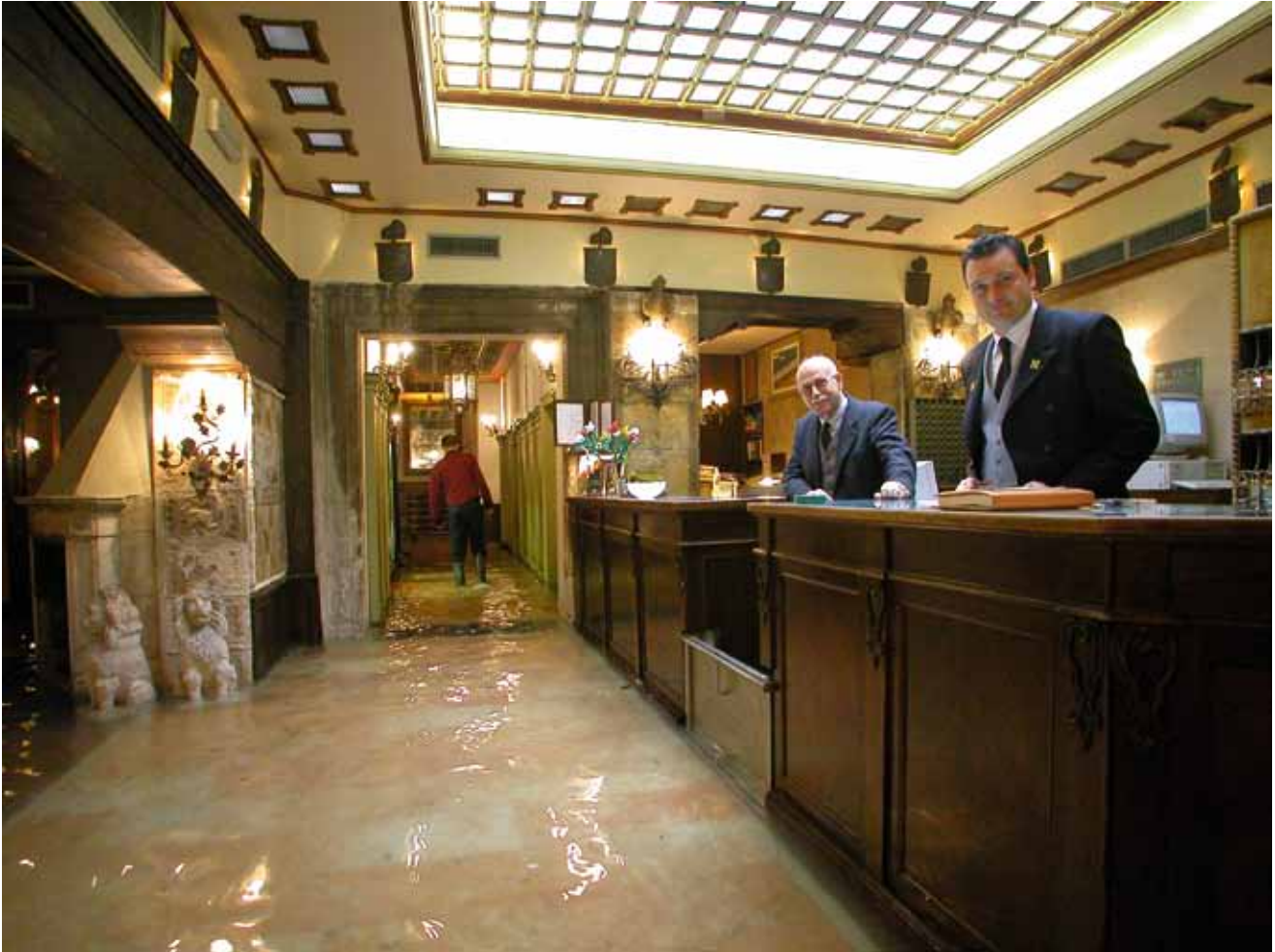
Fig. 9: Hotel lobby in Venice during acqua alta, October 2002

Dresden Conference. The photograph in Figure 8 (above) gave me an insight I had not had before – that the principle shaping influence on this now iconic bridge was most likely the threat of it being carried away by a raging torrent of floodwaters passing through the narrow gap in the rock outcroppings that border the river at Mostar. When I compared the news images with the photograph I had taken five years before in Figure 8 (below), I realized that the original designers had experienced flooding at this location, and the technology at their disposal for the construction of a bridge to cross this river was masonry, but the bridge had to be both high enough and robust enough in its footings and piers to resist being washed away.