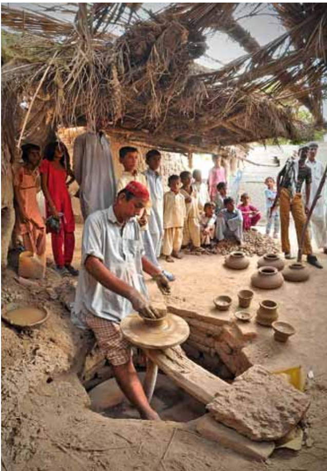
Fig. 2: Balhreji Village, adjacent to Mohenjo-Daro World Heritage site

Nearby, there are threats of a different kind, but which nevertheless have the potential of diminishing the heritage value of the archeological site, even while they directly affect the modern-era settlements that surround the heritage site. While on the UNESCO mission to report on the flood disaster's effects on cultural heritage, we visited several settlements outside of the designated historical zone. This is where modern changes to the level of floods may be a product of changes to the levees and barrages in the floodplain, which in the more usual high water seasons serve to prevent flooding, but when there is extraordinary rainfall, can accentuate the inundations.