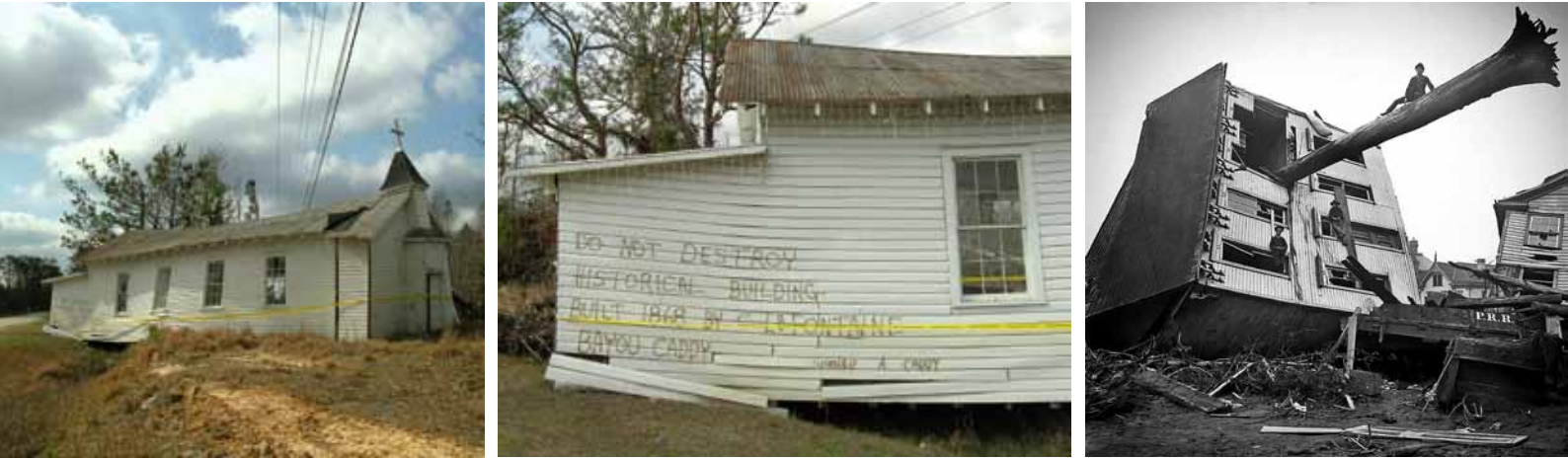
Fig. 4: Left and Centre: Historic church in Mississippi swept off foundations by Hurricane Katrina, right: A balloon frame wood house after the Johnstown Flood of 1889

tics. Both nourish and traverse two of the most important agricultural valleys in the world. Thus, the settlements in harm's way in both of these valleys were not only historically significant, but they continue to be necessary, in spite of modern motorized transportation. In the case of the Indus, archeological sites of early settlements date back to the Bronze Age, sites which have experienced periodic flooding now for four thousand years; and yet, the remains of these prehistoric settlements are still there.