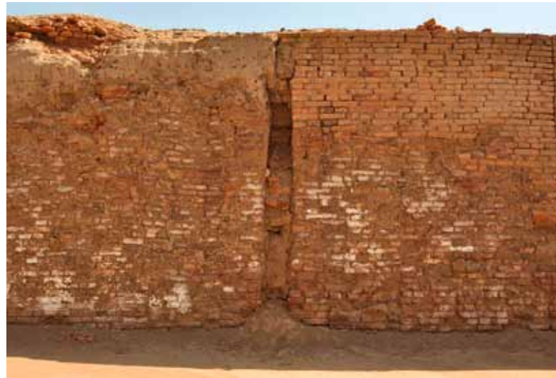
Fig. 1: Mohenjo-Daro

destruction of their culture. It was this deep cultural heritage and tribal communication that so effectively protected their very existence. 1 A simple message had been handed down from parents to sons and daughters: “if the sea retreats, you do too”. They took refuge by quickly climbing up the nearby hills on foot. It was this basic lifesaving message that was missing from the formal teachings found in modern schools in the countries around the Indian Ocean. 2