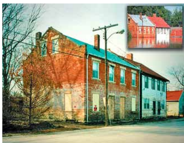
Fig. 3: Ste. Genevieve, Missouri, USA after the Great Midwest Floods of 1993. Above: emergency levee. Below: flooded historic houses outside of temporary levee

inary emergency levee came within only inches of being overtopped, but it held, preventing the town center from being flooded. However, a number of houses were left outside of it, as they were too low and close to the river for the emergency wall to protect them. These included the historic buildings visible in Figure 3.