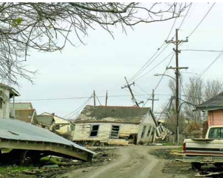
Fig. 7: New Orleans Lower 9th Ward after levee break

Napoleon Bonaparte and Thomas Jefferson. With what then became known as the Louisiana Purchase, the size of the United States was doubled.